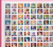
David Hockney A modern artist from Britain who is known for his Pop art.

Working collaboratively means to work in a group on the same piece of work.